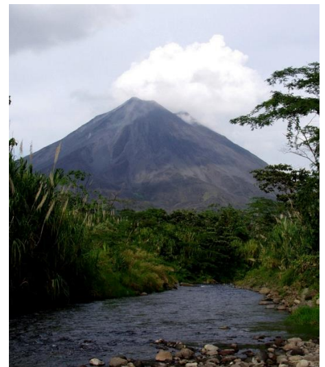
COSTA RICA. 2011. JPEG.

Another place to find relevant information is at the international travel sections of bookstores. Browse through or purchase one or two guidebooks, such as Let's Go , Rick Steves , Lonely Planet , Berkeley Guides , or Rough Guides . To travel light, download the mobile app version of the travel guides.