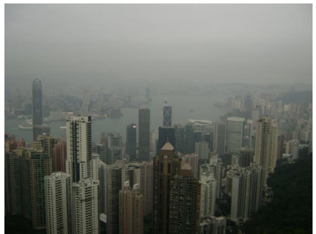
WALSH, RYAN. GUANGZHOU-SHENZHEN-HONG KONG EXPRESS RAIL LINK. CHINA. 2011

This section will inform you on common traveling and packing concerns that you may for your trip abroad. Before for departure date, you will need to apply for a passport (if you don't already have a valid one). Depending on your travel destination, you may need to apply for a visa. Not all countries require a visa. You will need to ensure that your financial institution is aware that you will be traveling abroad. It is also recommended to bring extra money in the foreign currency of your destination for any unexpected situations. When calculating how much money to bring for your study abroad experience, it is best to create a budget. When traveling abroad, you should leave all items that will not be needed at home. Always bring a digital copy of your valuable documents.