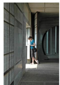
ITALY. 2008. JPEG.