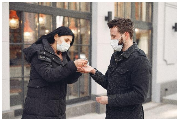
Photograph by Gustavo Fring. 2020. JPEG

As always, we will endeavor to update you with timely information about specific health and safety guidance important for our international programs. Acceptance of these terms is required to travel.