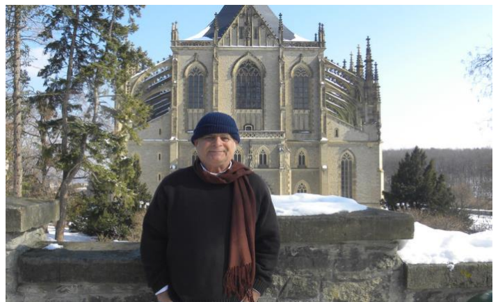
SPRING BREAK IN PRAGUE. 2010. JPEG.

It is likely exams will be essay-type. Before you take your first exam, ask for clarification of the grading system. This will help alleviate any surprises when you receive your results! We also recommend speaking to students of the host institution, so as to get a feel for the type of exams, and how to study.