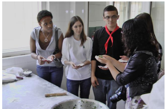
USF CHINESE LEARNING IN THE CULTURE PROGRAM – TIER II. 2010. JPEG.