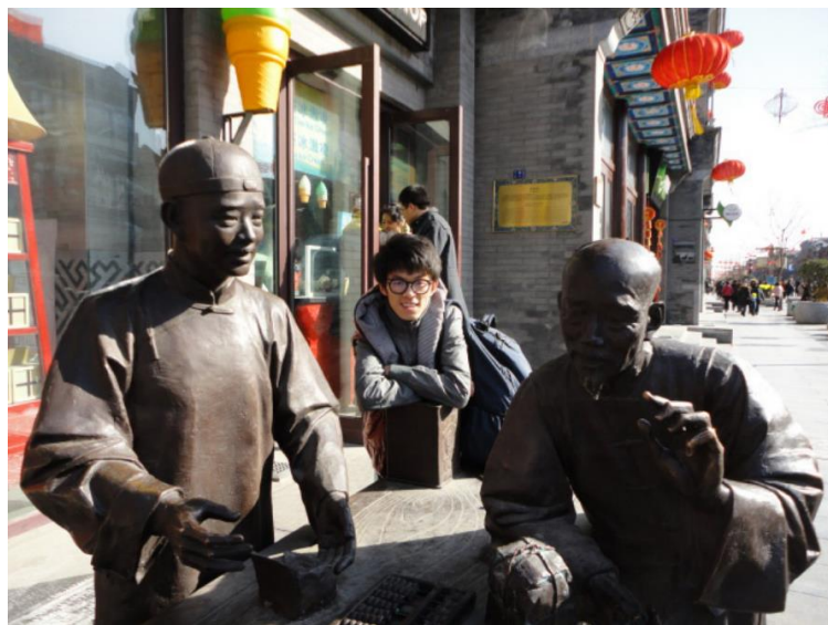
SPRING BREAK IN CHINA. 2012. JPEG.

Once you have your passport, be sure to sign it and fill in the emergency information page.