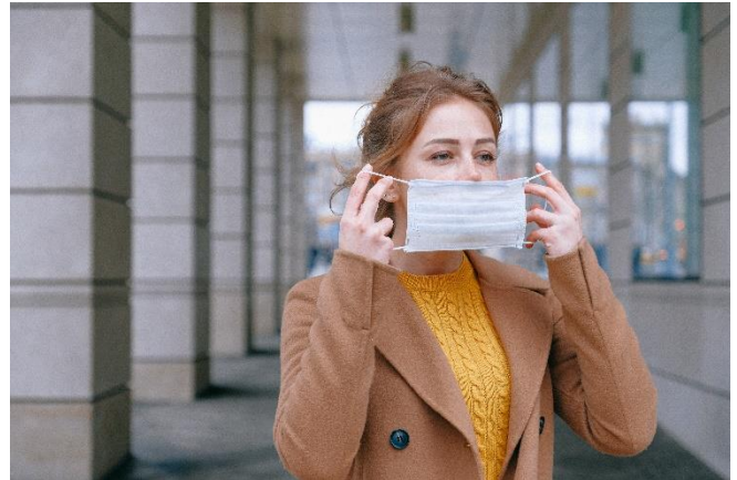
2020. JPEG

The USF Student Code of Conduct also applies internationally: https://usf.app.box.com/v/usfregulation60021 (Links to External Site).