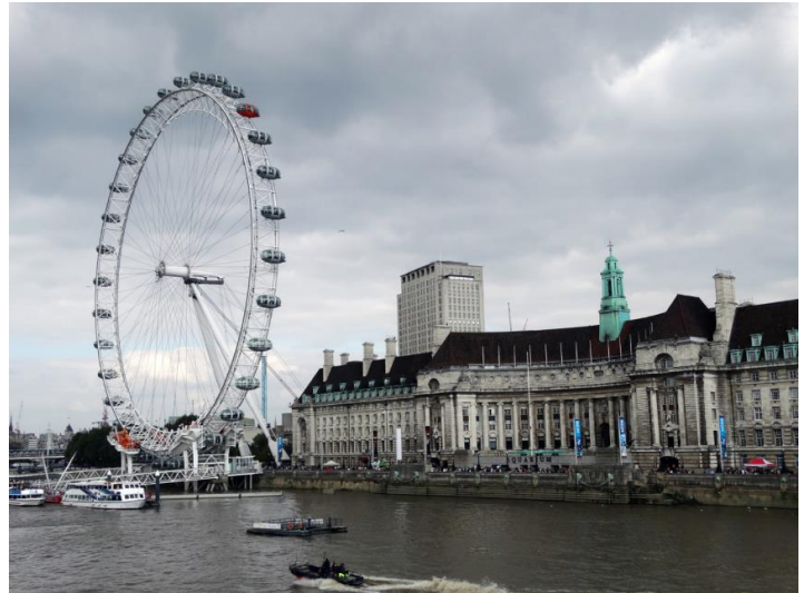
SUMMERLAB: ARCHITECTURE IN LONDON. 2014. JPEG.

Chip-and-PIN credit cards are credit cards with a built-in chip for added security. Instead of the traditional credit cards that are swiped, the card is inserted into the chip reader and the card's owner inputs a PIN to complete the transaction. While the roll out of this technology is slowly coming into use in North America, it is already widespread in Western Europe, especially in the United Kingdom. While most vendors still have a credit card "swipe" option, travelers should be prepared to use alternative payment methods should the traditional method not be available. You may pre-purchase a chip-and-PIN credit card from companies like Travelex ( www.travelex.com ) with funds pre-loaded on the card if you so desire. Inquire with your credit card company as to the availability of this technology with your existing cards.