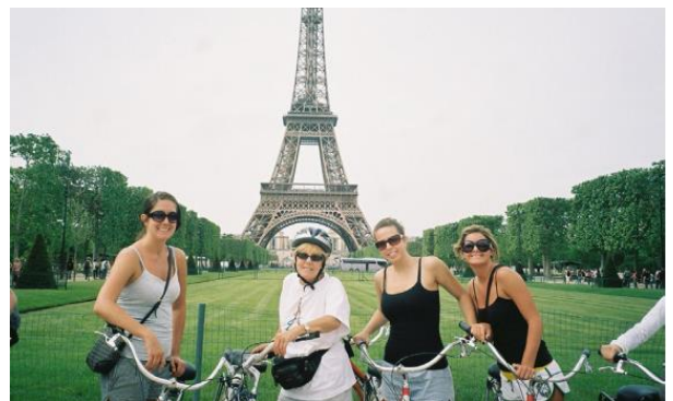
USF LONDON AND PARIS PROGRAM. 2010. JPEG.