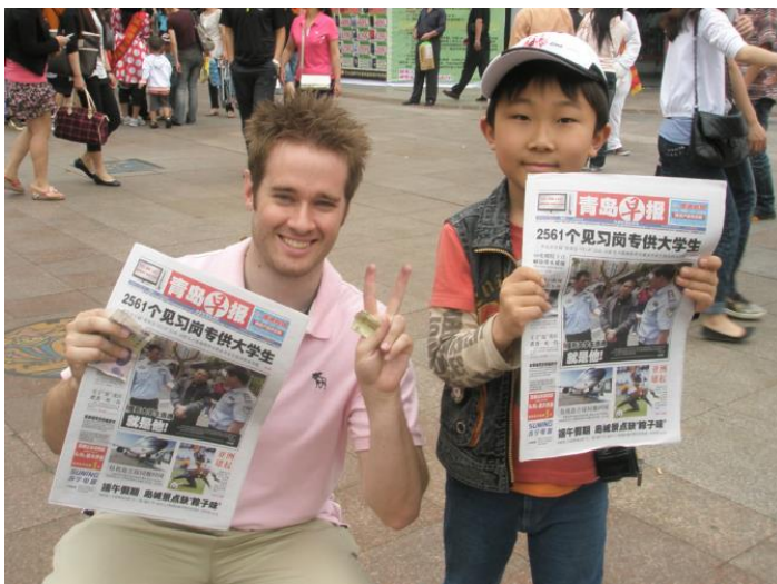
USF CHINESE LEARNING IN THE CULTURE PROGRAM – TIER II. 2010. JPEG.