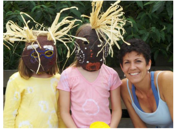
GATTUSA, ROBIN. BRITISH SCHOOLS EXPERIENCE. 2007. JPEG.

Your health and safety abroad are of utmost importance to USF, and we hope they are for you as well. This module is going to spend some time familiarizing you with the health and safety resources USF has to offer as well as outlining some of your responsibilities in this endeavor. If possible, start working on the activities discussed in this section at least 8 weeks prior to departure! When you have completed the review of Pre-Departure Health Considerations, you should be well on your way to having a healthy experience abroad by completing the following tasks.